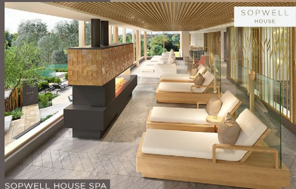
SOPWELL HOUSE SPA