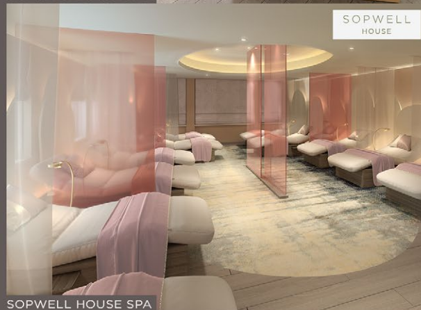
SOPWELL HOUSE SPA